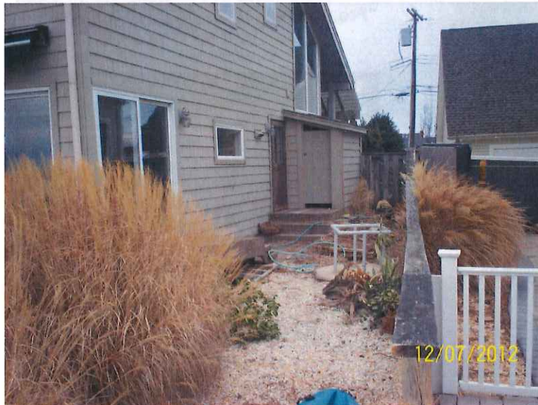
"Left Side View"