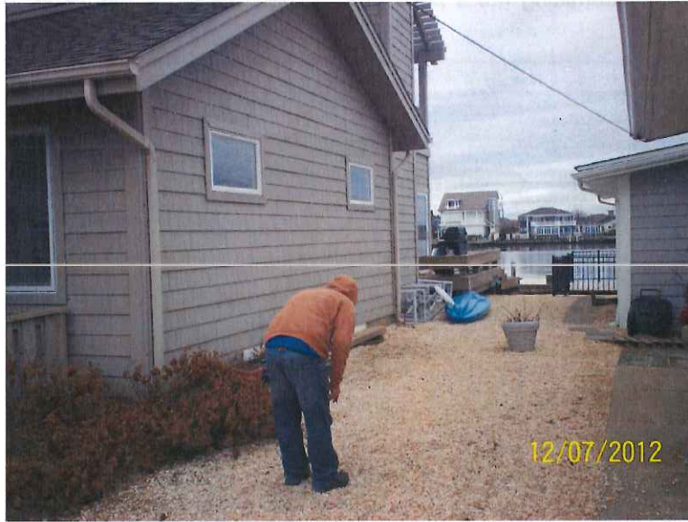
"Right Side View"

If submitting more photographs than will fit on the preceding page, affix the additional photographs below. Identify all photographs with: date taken; "Front View" and "Rear View"; and, if required, "Right Side View" and "Left Side View."