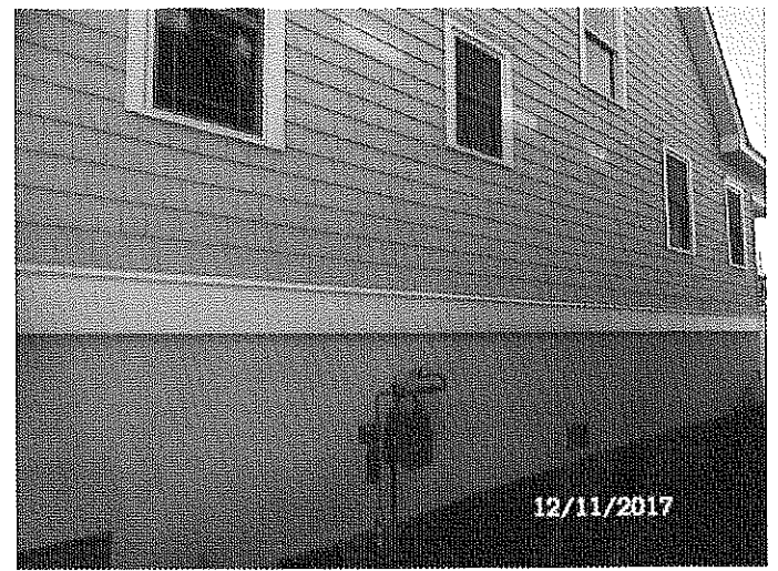
Left Side View – Date of Photograph: (See Photo Stamp)