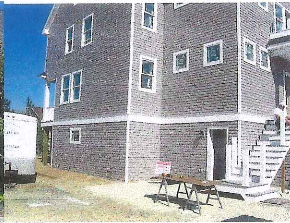
LEFT SIDE VIEW 10/18/16