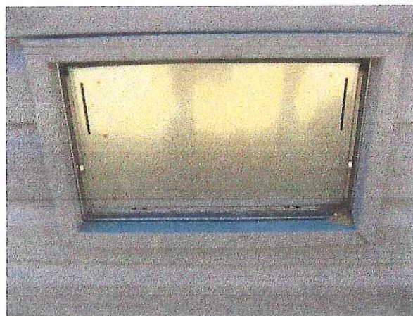
SMART VENT VIEW 10/18/16