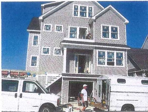
FRONT VIEW 10/18/16

If using the Elevation Certificate to obtain NFIP flood insurance, affix at least 2 building photographs below according to the instructions for Item A6. Identify all photographs with date taken; "Front view" and "Rear view"; and, if required, "Right Side View" and "Left Side View." When applicable, photographs must show the foundation with representative examples of the flood openings or vents, as indicated in Section A8. If submitting more photographs than will fit on this page, use the Continuation Page.