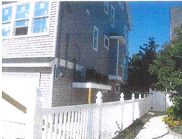
RIGHT SIDE VIEW 10/18/16