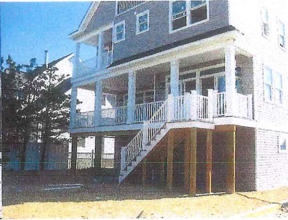
REAR VIEW 10/18/16