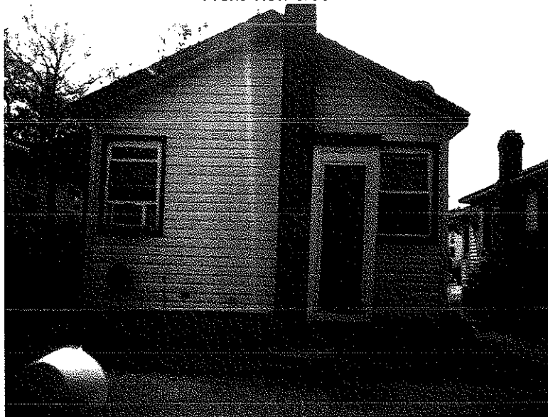
Rear View 9/09/13