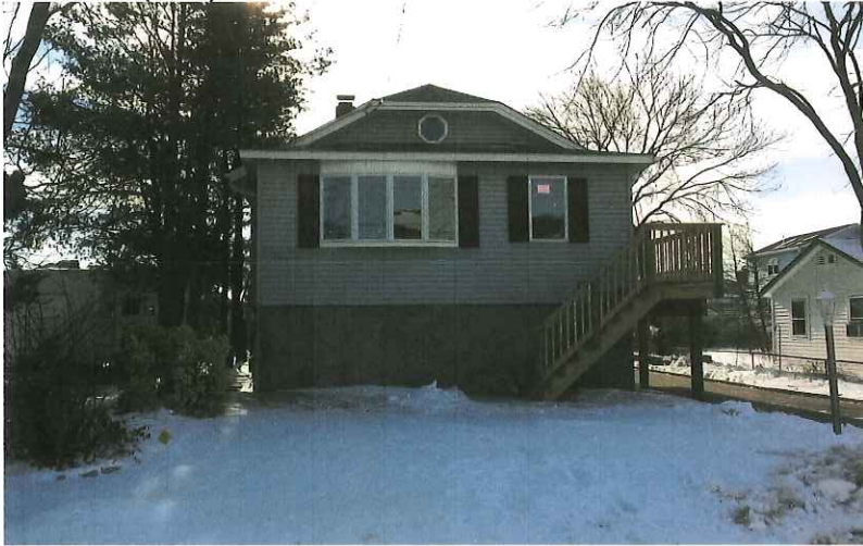
South side (back)