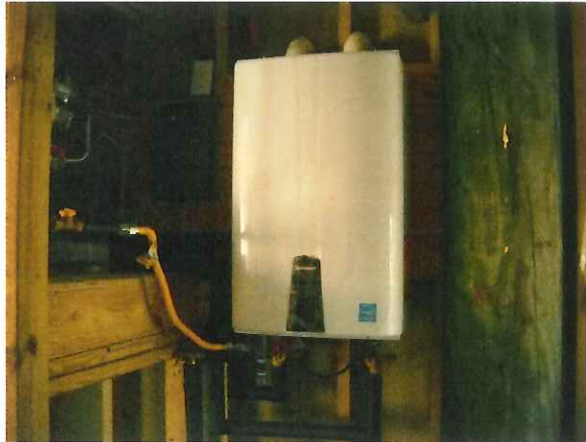
ALL PICTURES TAKEN 9-14-2015.