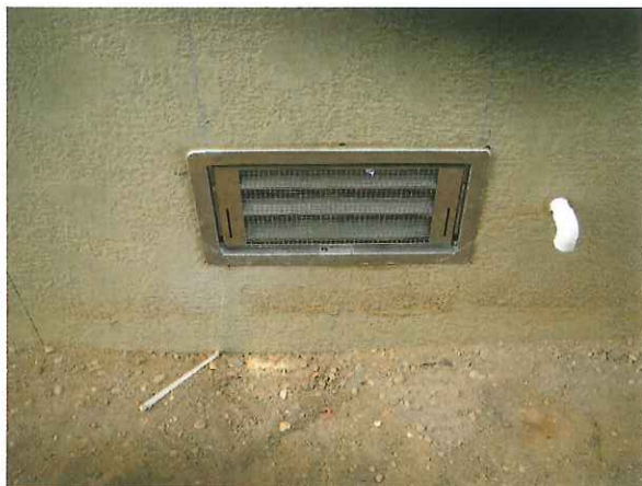
ABOVE PICTURE TAKEN 10-16-2015.