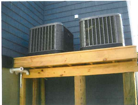
ALL PICTURES TAKEN 9-14-2015