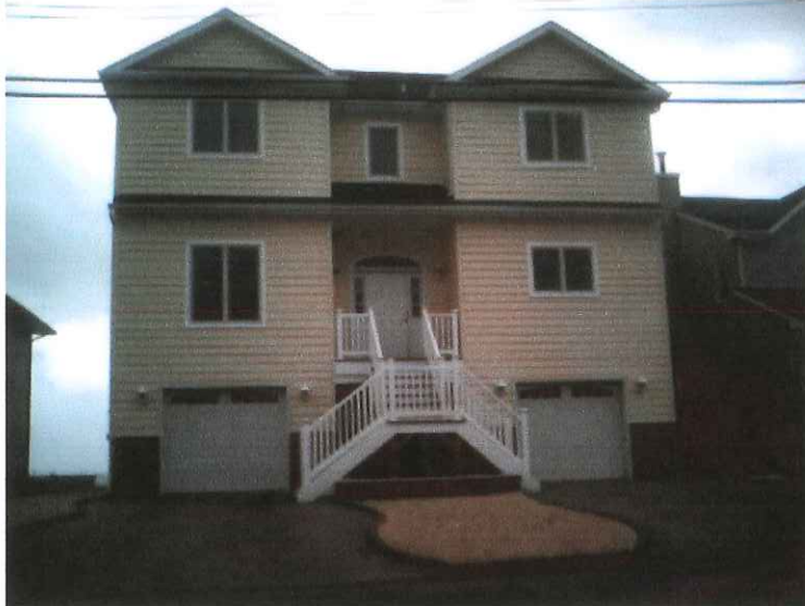
Front View 9/29/15

If using the Elevation Certificate to obtain NFIP flood insurance, affix at least 2 building photographs below according to the instructions for Item A6. Identify all photographs with date taken; "Front View" and "Rear View"; and, if required, "Right Side View" and "Left Side View." When applicable, photographs must show the foundation with representative examples of the flood openings or vents, as indicated in Section A8. If submitting more photographs than will fit on this page, use the Continuation Page.