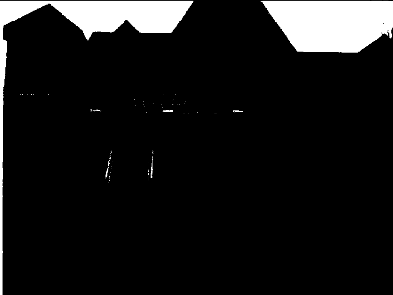
FRONT/ PHOTO TAKEN 9/01/06