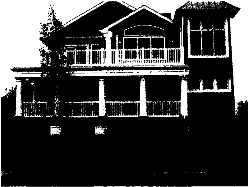
EAST SIDE/ PHOTO TAKEN 9/01/06