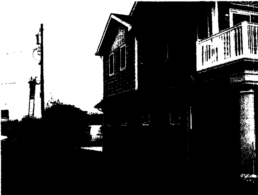
WEST SIDE/ PHOTO TAKEN 9/01/06