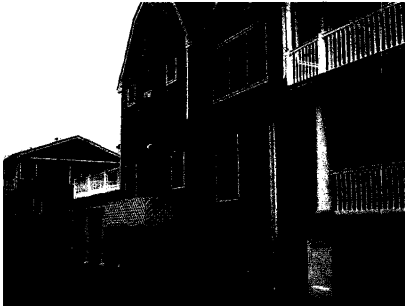
REAR/ PHOTO TAKEN 9/01/06