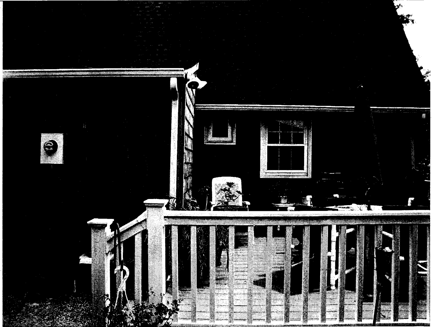
REAR VIEW 08-15-2013

If submitting more photographs than will fit on the preceding page, affix the additional photographs below. Identify all photographs with: date taken; "Front View" and "Rear View"; and, if required, "Right Side View" and "Left Side View." When applicable, photographs must show the foundation with representative examples of the flood openings or vents, as indicated in Section A8.