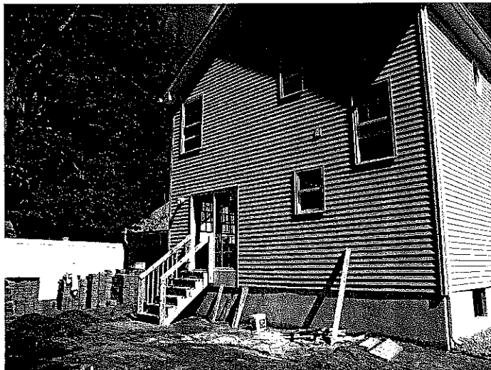
REAR OF 517 RIVERSIDE DRIVE SOUTH