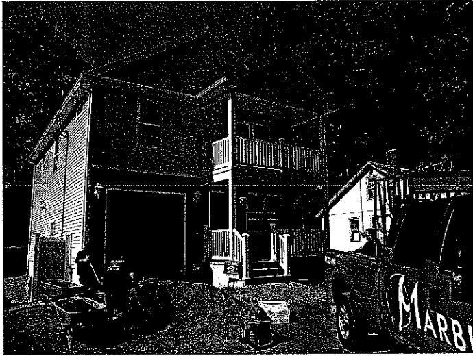
FRONT OF 517 RIVERSIDE DRIVE SOUTH

If using the Elevation Certificate to obtain NFIP flood insurance, affix at least 2 building photographs below according to the instructions for Item A6. Identify all photographs with date taken; "Front View" and "Rear View"; and, if required, "Right Side View" and "Left Side View." When applicable, photographs must show the foundation with representative examples of the flood openings or vents, as indicated in Section A8. If submitting more photographs than will fit on this page, use the Continuation Page.