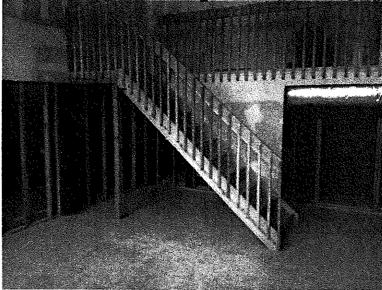
92 Vanard Drive, Ducting, 02/26/14

If submitting more photographs than will fit on the preceding page, affix the additional photographs below. Identify all photographs with: date taken; "Front View" and "Rear View"; and, if required, "Right Side View" and "Left Side View." When applicable, photographs must show the foundation with representative examples of the flood openings or vents, as indicated in Section A8.