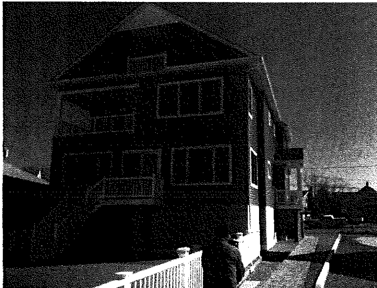
92 Vanard Drive, Rear, 02/24/14