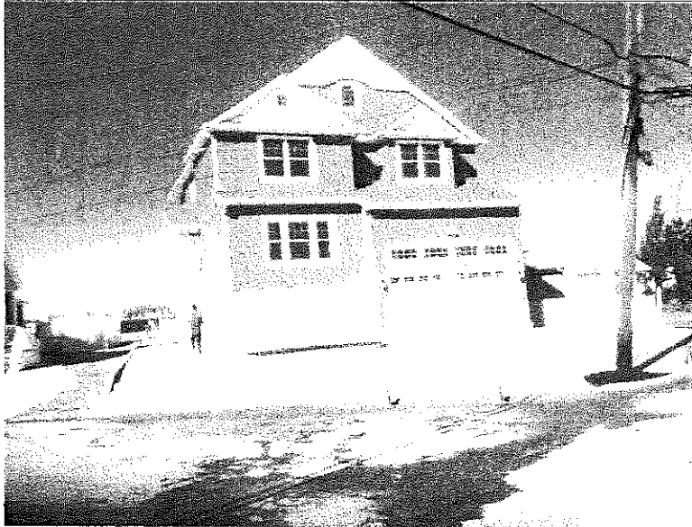
92 Vanard Drive, Front, 02/24/14

If using the Elevation Certificate to obtain NFIP flood insurance, affix at least 2 building photographs below according to the instructions for Item A6. Identify all photographs with date taken; "Front View" and "Rear View"; and, if required, "Right Side View" and "Left Side View." When applicable, photographs must show the foundation with representative examples of the flood openings or vents, as indicated in Section A8. If submitting more photographs than will fit on this page, use the Continuation Page.