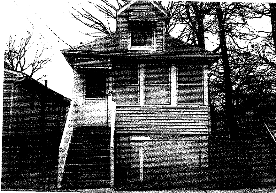
"Front View" 04 / 19 / 2014

If using the Elevation Certificate to obtain NFP flood insurance, affix at least 2 building photographs below according to the instructions for Item A6. Identify all photographs with date taken; "Front View" and "Rear View"; and, if required, "Right Side View" and "Left Side View." When applicable, photographs must show the foundation with representative examples of the flood openings or vents, as indicated in Section A8. If submitting more photographs than will fit on this page, use the Continuation Page.