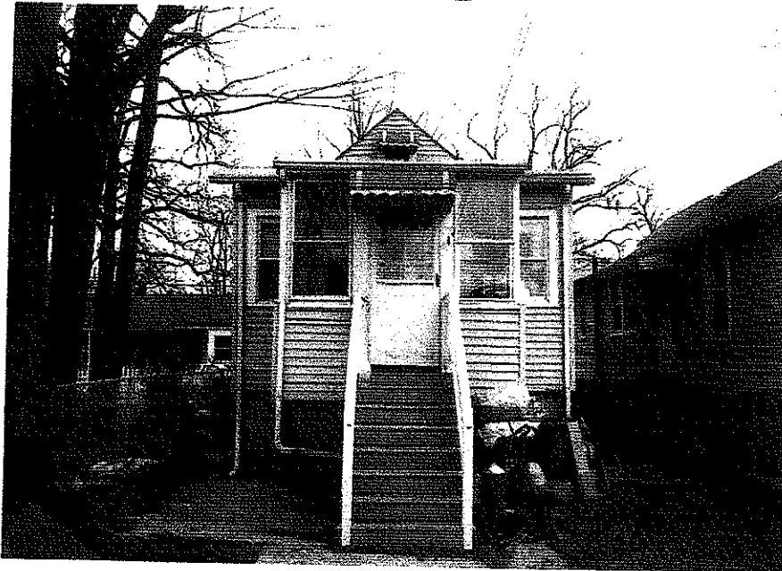
"Rear View" 04 / 19 / 2014